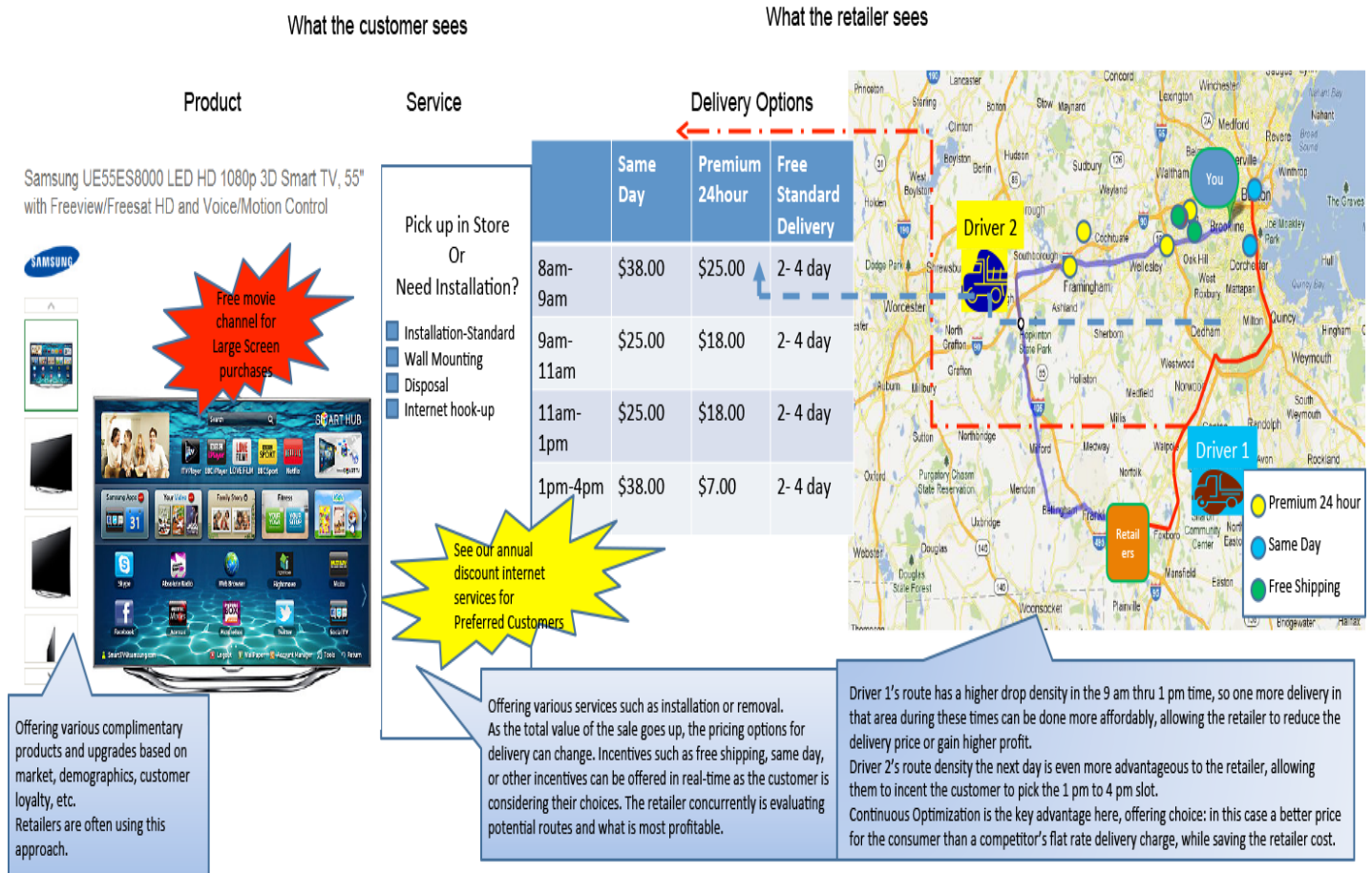
Figure 1- Continuous Optimization at the Point of Ordering

To get these kinds of results, retailers need to not just think about the point of sale , but rather about what is happening during point of ordering .